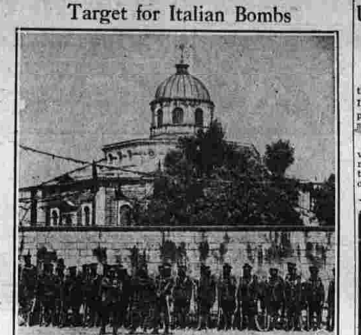
The cathedral of St. George, outside which troops are shown on duty, is one of the Addis Ababa landmarks in danger of destruction should Italian aviators bomb the Ethiopian capital.